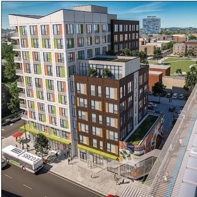
Landon Bone Baker Architects and Moody Nolan

Transit Oriented Developments. The style of urban design known as Transit Oriented Developments, or TODs, builds an entire neighborhood around proximity to a new or existing mass transit stop or station. Residential, service, commercial, and transit features are combined, at a