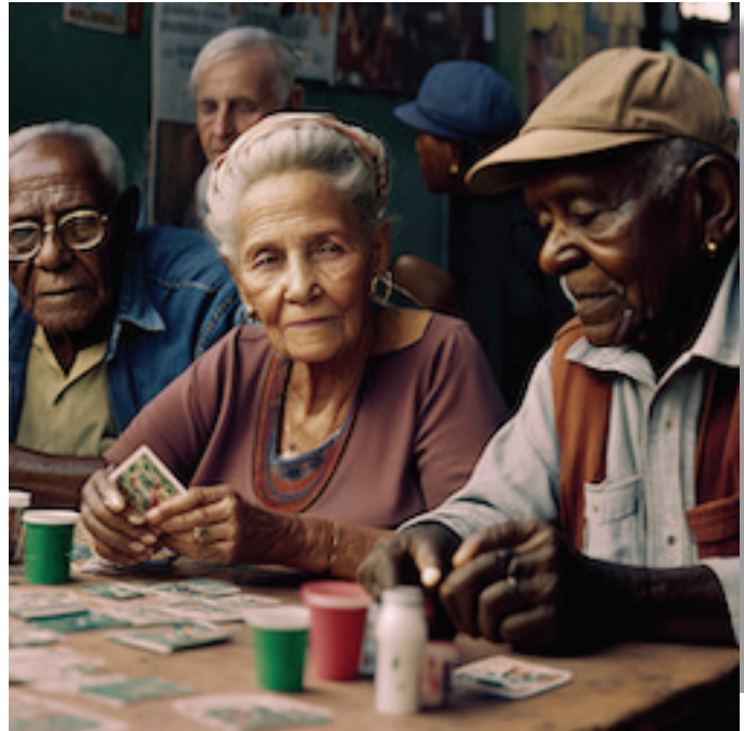
Midjourney AI / ADA

Assisted living (AL) is an important residential option for older adults and persons with disabilities who can live semi-independently and do not require the onsite medical and therapeutic resources of a skilled nursing facility. Such individuals and couples benefit from the 24-hour safety, prepared meals, transportation, flexible visiting, and leisure services typically provided in assisted living communities, allowing them to forestall or avoid altogether the very expensive and often restrictive environment of a skilled nursing facility. However, the cost of private-pay assisted living is too high for most individuals who may otherwise qualify. High cost limits access, and also limits demand for assisted living units, making it more difficult to justify owners' investment in expansion or construction of new AL communities.