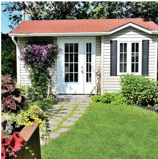
California Department of Housing and Community Development

The Rhode Island General Assembly passed legislation in 2017 that established a “by right” designation for ADUs created and utilized by family members 62 and older and family members with disabilities. In 2022, the Rhode Island General Assembly passed another piece of legislation on ADUs. This legislation (House Bill 7942 Sub B) amended the definition of an accessory dwelling unit (ADU) to provide a consistent, statewide framework and efficient process for the approval and permitted use of these units. The act would also permit ADUs to be counted towards low- and moderate-income housing requirements, if income and other limitations are met.